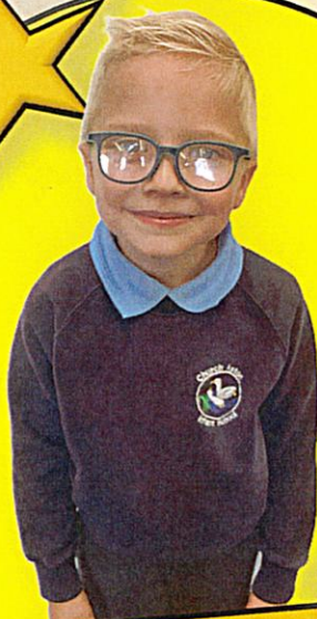
Class 2 STAR OF THE WEEK