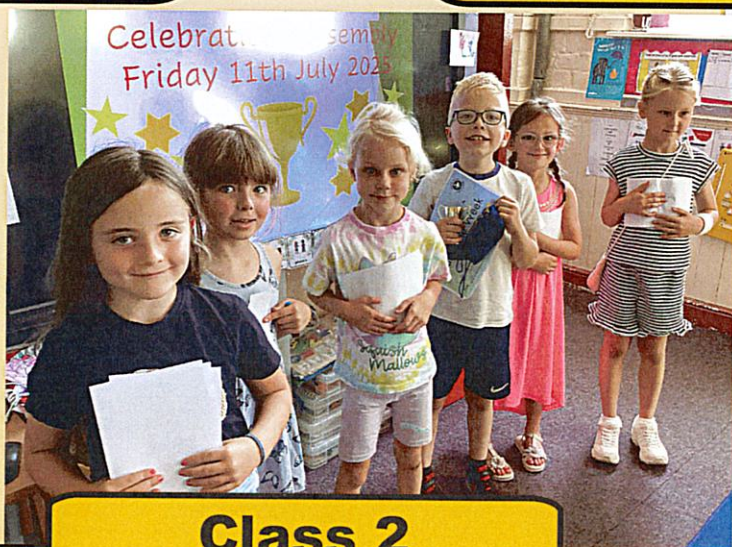
Class 2 Stars