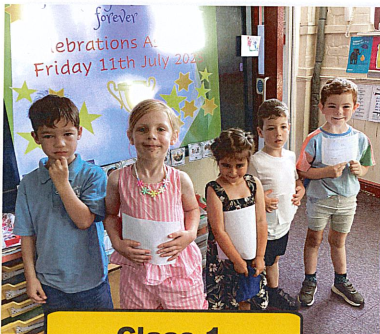
Class 1 Stars