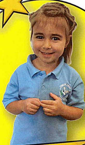
Class 1 STAR OF THE WEEK

Well done to all the children that received an award this week.