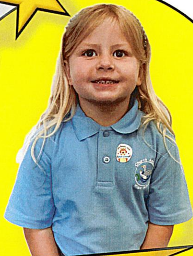
Class 1 STAR OF THE WEEK

Well done to all the children that received an award this week.