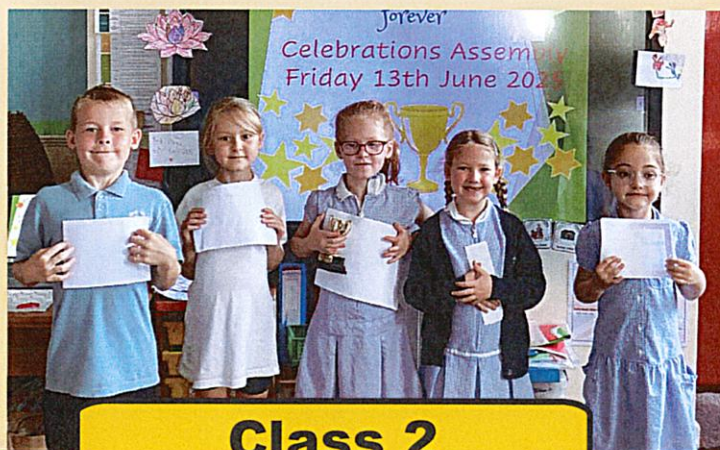
Class 2 Stars