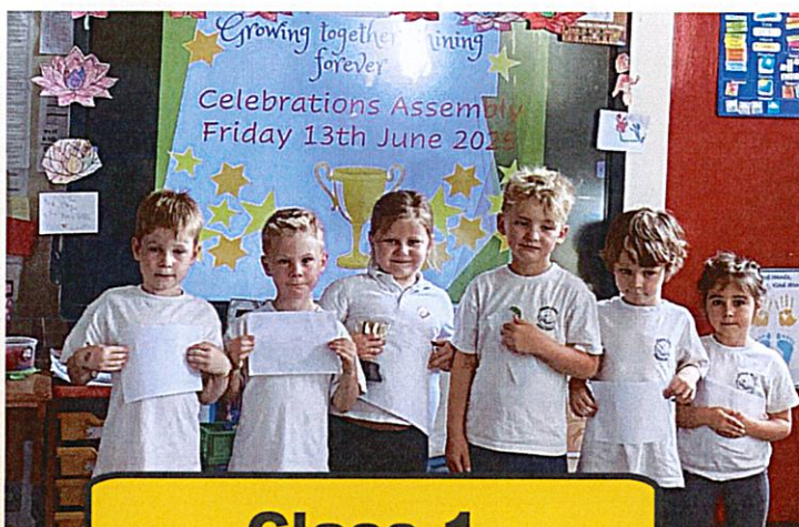
Class 1 Stars