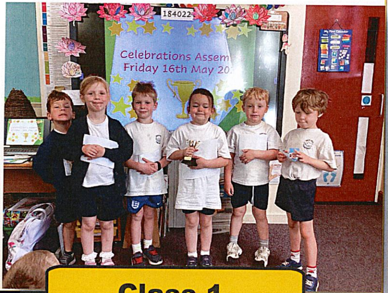
Class 1 Stars