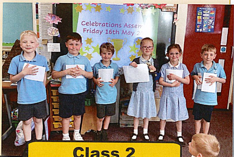
Class 2 Stars