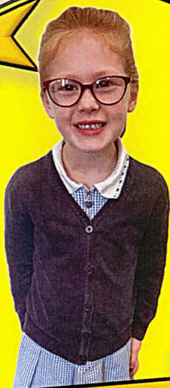
Class 2 STAR OF THE WEEK