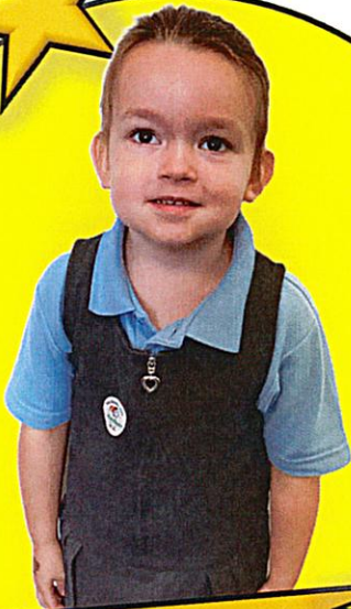
Class 1 STAR OF THE WEEK

Well done to all the children that received an award this week.