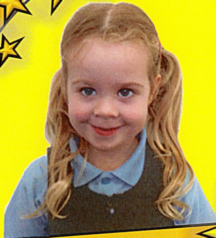
Class 1 STAR OF THE WEEK

Well done to all the children that received an award this week.