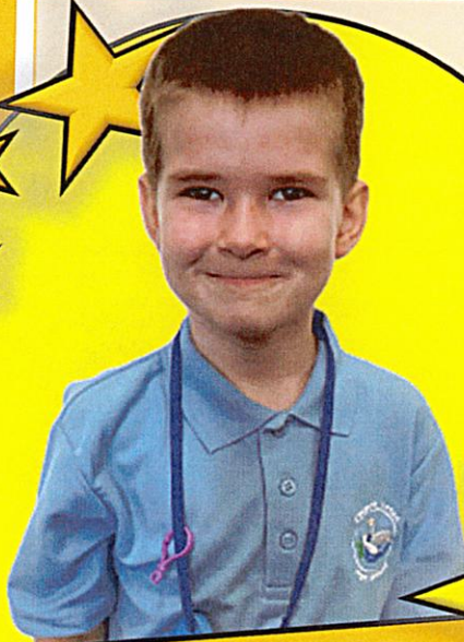
Class 2 STAR OF THE WEEK