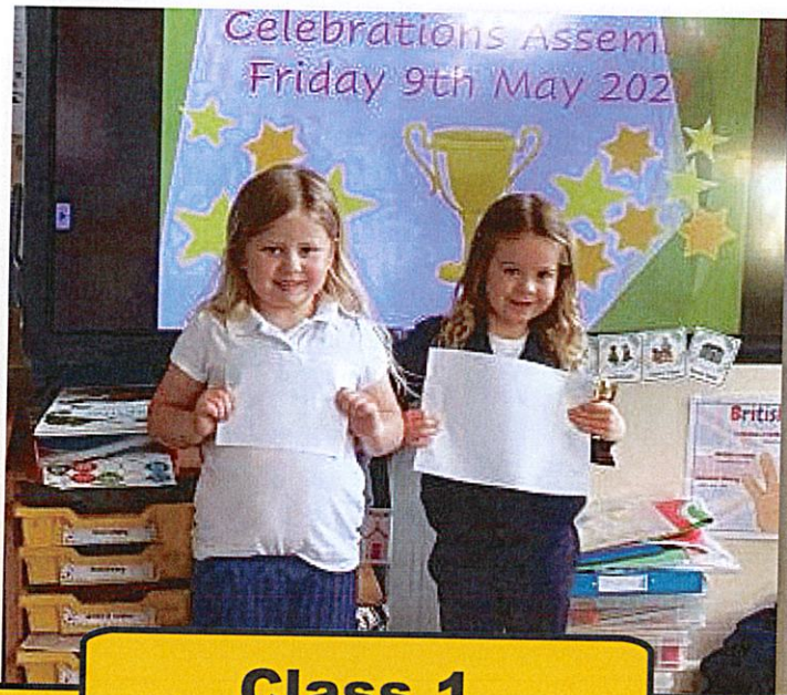
Class 1 Stars